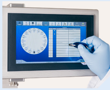
2. Method selection and / or input