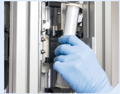
3. "Click-in" the columns into the column carousel