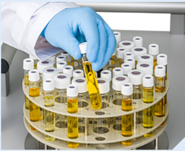
1. Load the system with the samples

The user just have to place the samples into the system, chose or modify a stored method, and insert the ready-to-use columns into the column carousel: