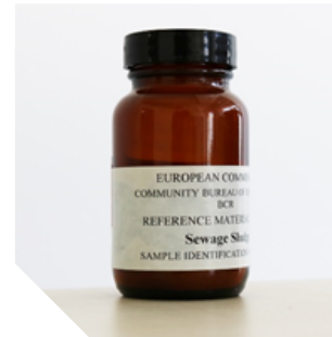
Image 2 LCTech Laboratory, Obertaufkirchen

As shown in the figures above, the recoveries (74 – 131 %) of native PCB and Dioxins are quite good, in comparison to the assigned values of the reference materials.