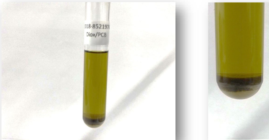
Figure 1 and 2: Sample with a high amount of precipitation

Examples of samples that should not be processed on the DEXTech 16 system are shown here.